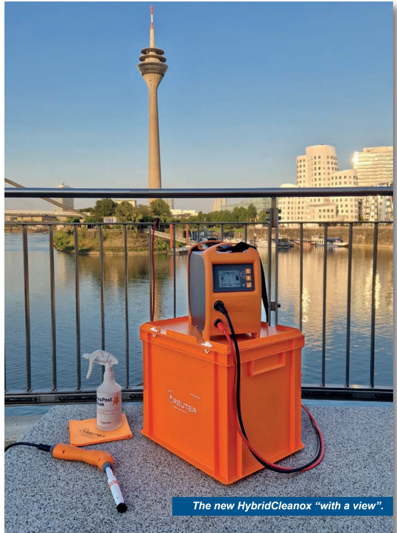
The new HybridCleanox “with a view”.

get a device set from a competitor for 25% cheaper, but you only get half as much out of it,” says Olaf Reuter confidently. And it goes on: numerous utility models, patents and