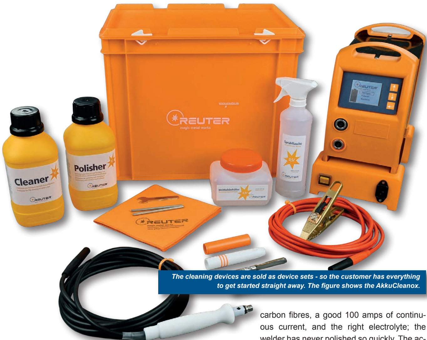
The cleaning devices are sold as device sets - so the customer has everything to get started straight away. The figure shows the AkkuCleanox.

brush - today everyone who has anything to do with metal construction knows that," says welding engineer Olaf Reuter, founder of Reuter GmbH & Co. KG, "and we only brought it onto the market in 2009. The iPhone had been around for two years." Take a million