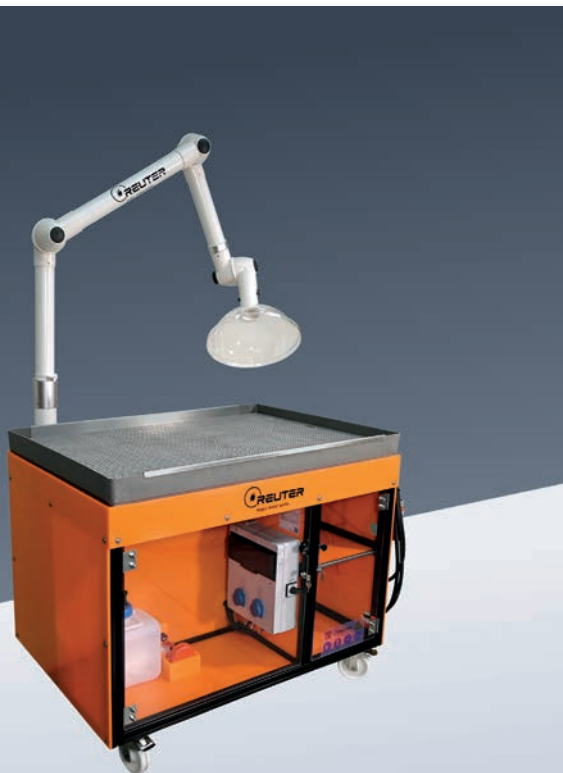
Reuter also offers complete workstations for cleaning welds. The WorkStations are available in different sizes and designs.

many new ideas keep the competitors at bay: the AutoFeed, the self-regulating automatic electrolyte supply, the Cleanox 5.0, with inte-